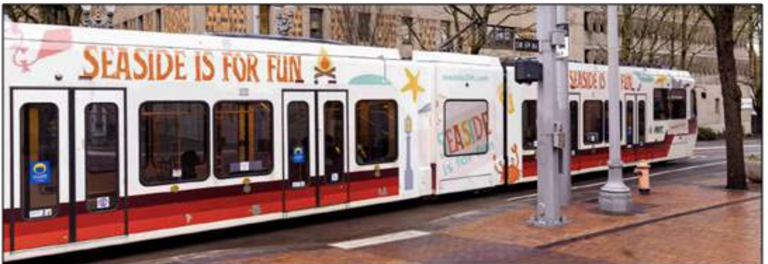
Bonus Pic: One of our MAX Light Rail trains in circulation now in the Portland Metro.

(503) 738-3097 7 N Roosevelt Dr., Seaside, OR 97138 www.seasideor.com